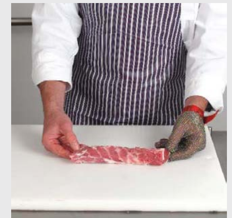
6. Neck fillet external view.