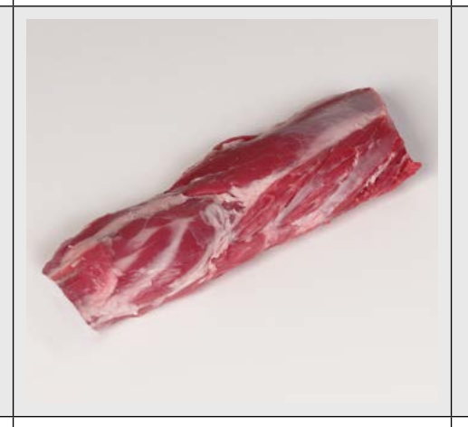
7. Neck fillet internal view.